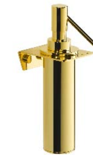
Dosificador pared Wall soap dispenser 36.78.01.001