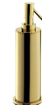
Dosificador sobremesa nº2 F/standing soap dispenser nº2 36.78.32.001