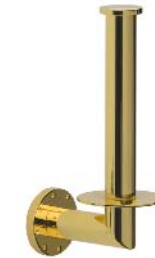
Portarrollos auxiliar nº1 Spare paper holder nº1 36.40.42.001