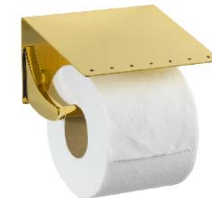
Portarrollos nº2 (usa) / derecho (right) Right paper holder nº2 36.40.02.001