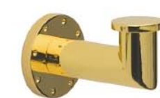
Colgador nº 2 Hook nº2 36.30.01.001