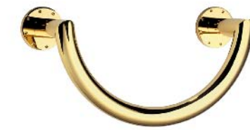
Argolla Towel ring 36.20.55.001