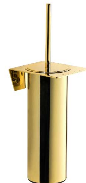
Escobillero pared Wall toilet brush holder 36.90.01.001