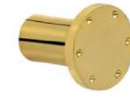
Colgador nº 1 Hook nº1 36.30.11.001