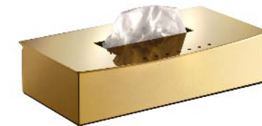
Caja kleenex Tissue box 36.94.01.001