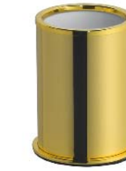
Portacepillos sobremesa F/standing toothbrush holder 36.70.50.001