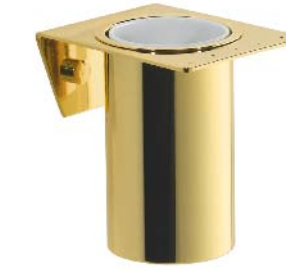
Portacepillos pared Wall toothbrush holder 36.70.01.001