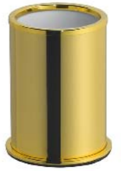
Portacepillos sobremesa F/standing toothbrush holder 36.70.50.001