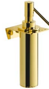
Dosificador pared Wall soap dispenser 36.78.01.001