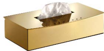
Caja kleenex Tissue box 36.94.01.001