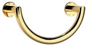
Argolla Towel ring 36.20.55.001