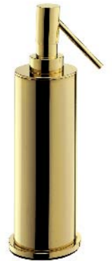
Dosificador sobremesa n°2 F/standing soap dispenser n°2 36.78.32.001