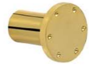
Colgador n° 1 Hook n°1 36.30.11.001