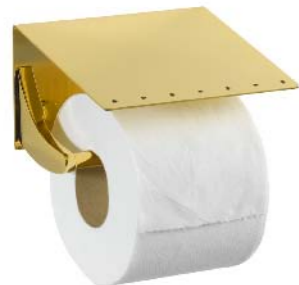
Portarrollos n°2 (usa) / derecho (right) Right paper holder n°2 36.40.02.001