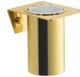
Portacepillos pared Wall toothbrush holder 36.70.01.001