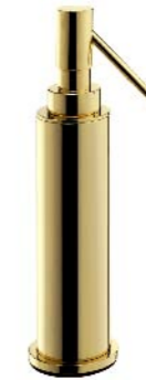
Dosificador sobremesa n°1 F/standing soap dispenser n°1 36.78.31.001