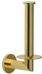
Portarrollos auxiliar n°1 Spare paper holder n°1 36.40.42.001