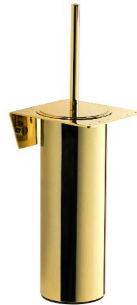
Escobillero pared Wall toilet brush holder 36.90.01.001