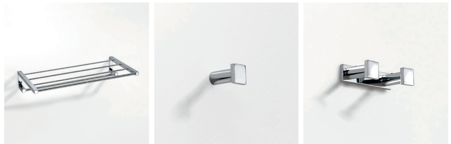
TOALLERO 60 TOWEL RAIL 60 38.10.60 ●●