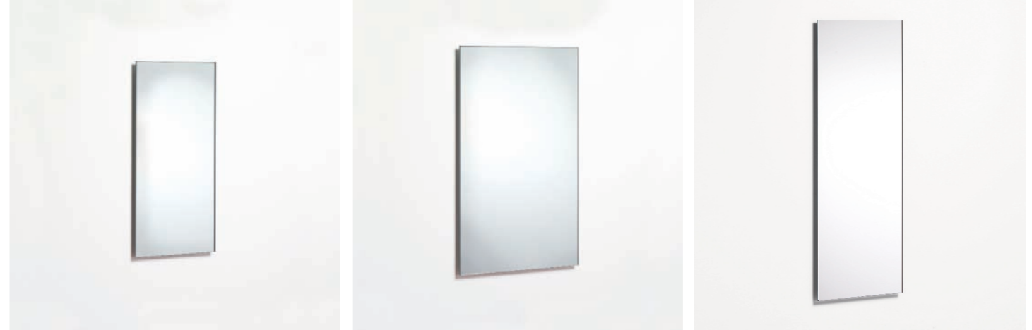
ESPEJO KUBIC 40 X 85 MIRROR 40 X 85 36.80.50.050