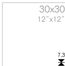
BRICK 30TS PEI 3