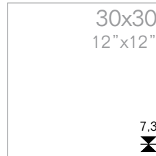
BRICK 30DG PEI 3