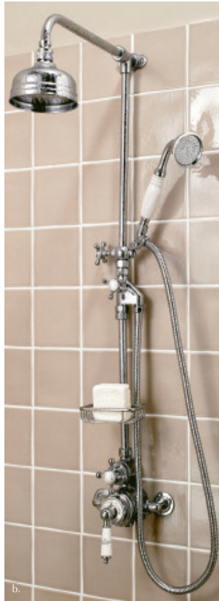
b. Victorian exposed shower valve with 5" Flowmaster shower head, rigid riser, Victorian shower tidy soap rack and handset