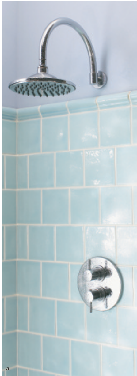
a. Isis concealed 2 hole shower with Energiser 6" fixed head