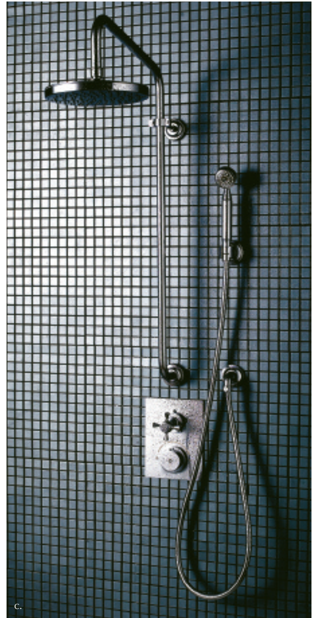
c. Cisne luxury concealed shower kit with handset and Cisne 200mm shower head

All available in Chrome, Antique Gold or Polished Nickel finishes