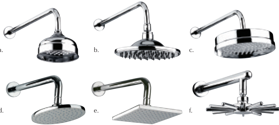
a. Flowmaster fixed head Available in 5" or 8"

Imperial thermostatic valves, in modern or traditional styles, ensure that the water remains at exactly the temperature you set regardless of pressure changes. It's also an important safety feature for children and older people.