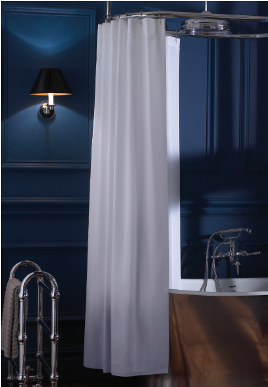
As featured: Radison Cast Iron bath with Aluminium skirt Oval curtain rail Vuelo brassware